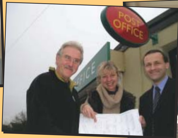
● Opening the newly-refurbished post office at Coalpit Heath