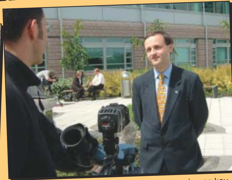
● Using the national and local media to campaign on key issues