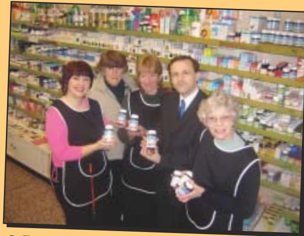
● Fighting for the rights of local people to buy the vitamins and herbal supplements of their choice