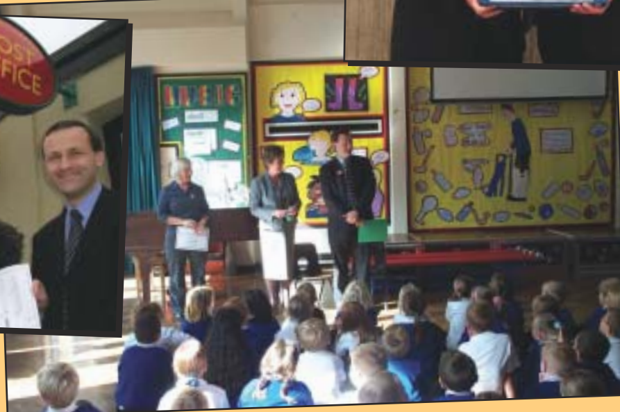
● Visiting a local primary school