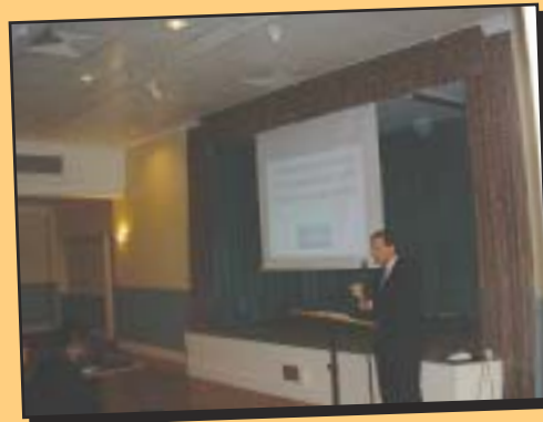
● I am a patron of a local charity to help people with drug and alcohol problems, the Two Bridges Trust