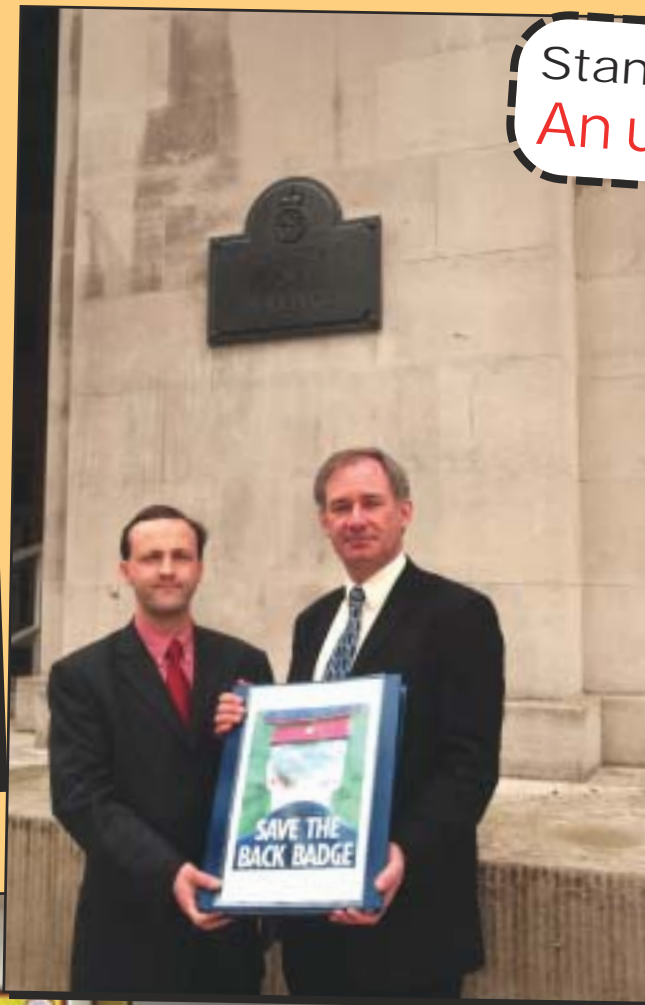
● Presenting a petition in March to the Defence Secretary Geoff Hoon in support of the campaign to save the Glosters Back Badge

Published & Promoted by Steve Webb MP, Poole Court, Poole Court Drive, Yate, BS37 5PP. Printed by SP Press, Mendip Vale Business Park, Cheddar.